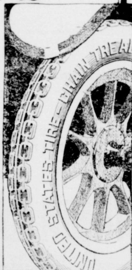
The U. S. CHAIN TREAD One of the few tires of which it may be said that they deliver economy year in and year out and tire after tire.