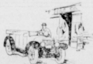
"You get a fresh, live tire every time you buy a U. S. Tire."

A sound reason for the fact that you see more U. S. Tires on more cars than ever this year.