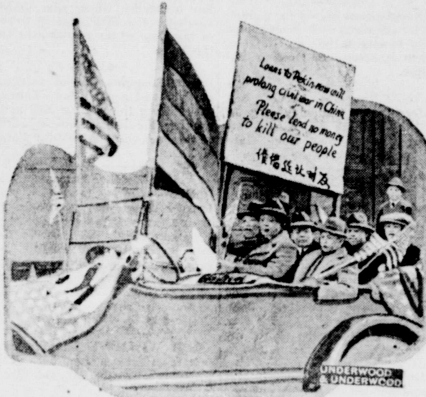
Chinese throughout the country recently ushered in the year 4908 of their calendar. In the Chinese section of Boston the key word of the new year was to stop the loans to Peking, thereby ending the civil war in China.