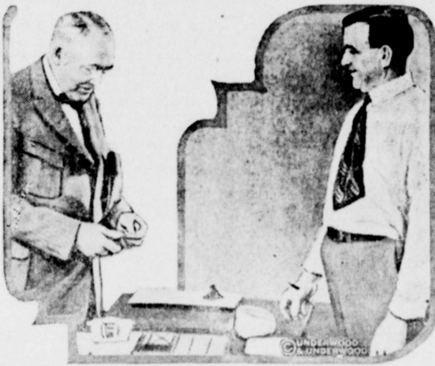
President Harding, the other day was eager for a game of golf, but it was too late to motor to any of the suburban clubs around Washington. He was reminded that for 25 cents he could play on the near municipal links, and the idea appealed to him. He is seen here paying his ground fee to the keeper of the public course.