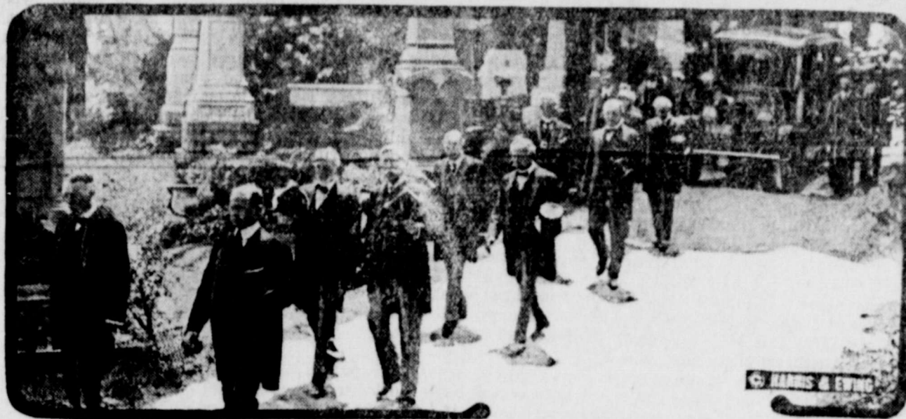
Members of the Supreme court of the United States leading the funeral procession of Edward Douglass White, chief justice of the United States, as they entered Oak Hill cemetery, Georgetown, D. C., where interment was made.