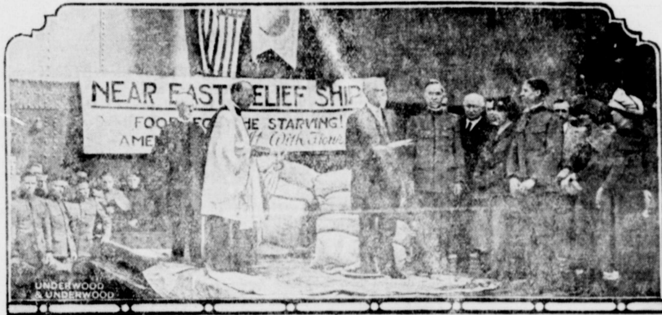
An impressive ceremony at pier 2, army base New York, attended the loading of the Mopang with 10,000 bags of flour and 2,000 tons of general foodstuffs for the starving of the Near East. Dr. Herbert Shipman, Suffragan bishop of New York, at the special request of Bishop Manning, blessed the ship and its cargo. The flour supplies were purchased with the funds raised by the Near East relief through their novel posters, "Say it with flour."

America "Says It With Flour" for the Near East