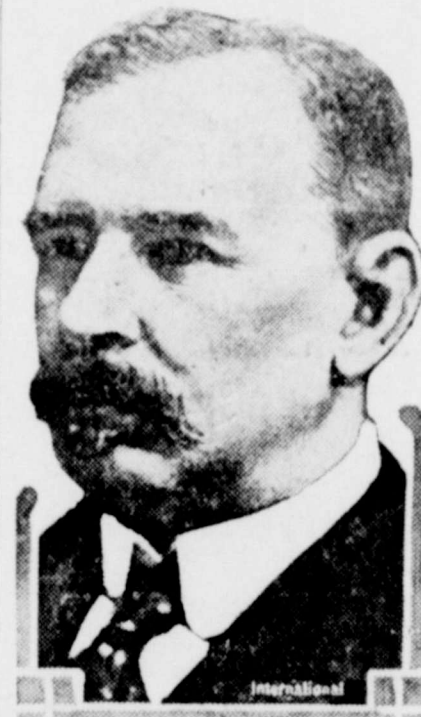
Prince von Hatzfeld, who was charged with mustering the German vote at the recent plebiscite in Upper Silesia, may become the new governor of that province, according to dispatches from Berlin. The prince has been a resident of Silesia since shortly after the armistice.