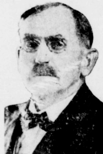
The Pioneer of Music in Western Texas

"The House With a Record of Thirty-One Years"