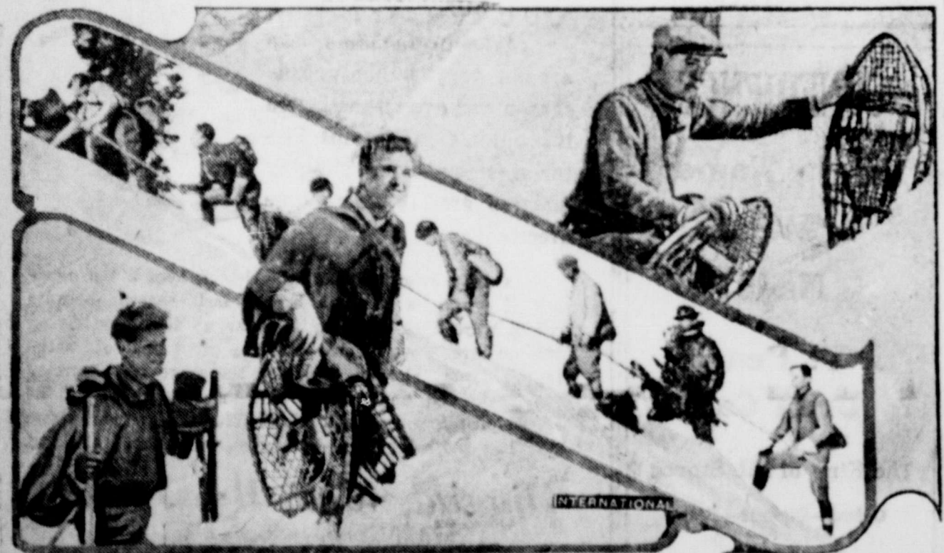
Forest S. Townsley, chief ranger in Yosemite National park (center, with hat off), with a party made a difficult and dangerous ascent from the floor of Yosemite valley to Glacier Point on the rim in snow in places nearly 8 feet deep. It took them 10 hours to make 11 miles and climb 3,250 feet. Going back they sat down and slid much of the way.