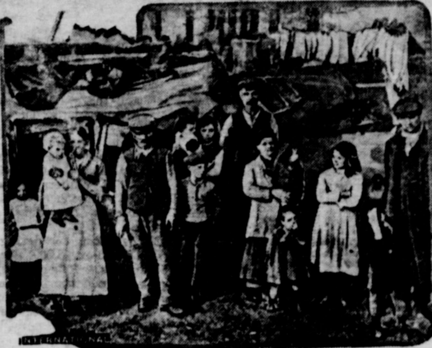
Several British war veterans and their families, unable to secure other shelter, are living in miserable huts at Sundridge Camp, Woking, England. Of course the sanitary conditions are bad. The veterans, however, say they must live and insist that they cannot find other quarters. The authorities are investigating.