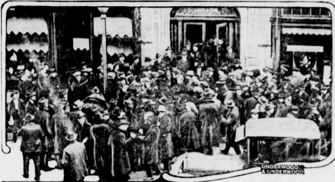
Oswald Garrison Villard, editor of the Nation, and formerly editor of the New York Evening Post, gave a Lincoln day address at the Woman's City club, Cincinnati. The crowd shown above, together with thousands of other persons, most of them members of the American Legion, or relatives and friends of men who lost their lives in the war, tried to break up the meeting, and would have succeeded, but that a riot call brought a large squad of police to the scene. They objected to the pacifist war record of the grandson of William Lloyd Garrison.