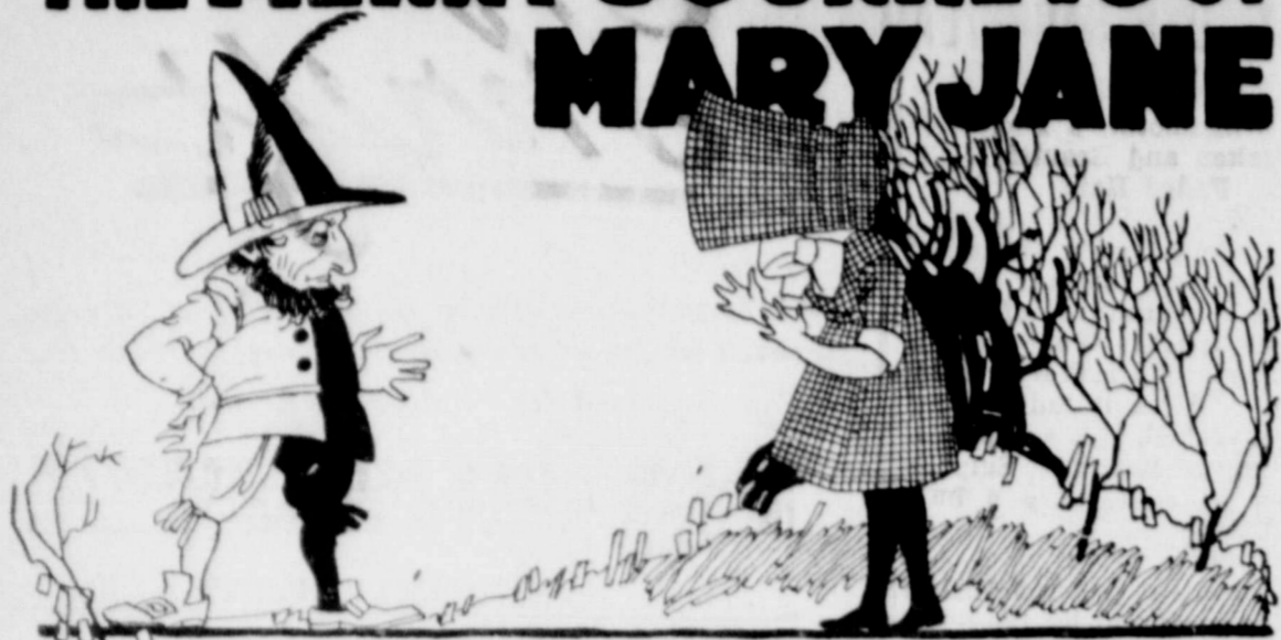
"It's the best thing I ever tasted"—says Old John to Mary Jane