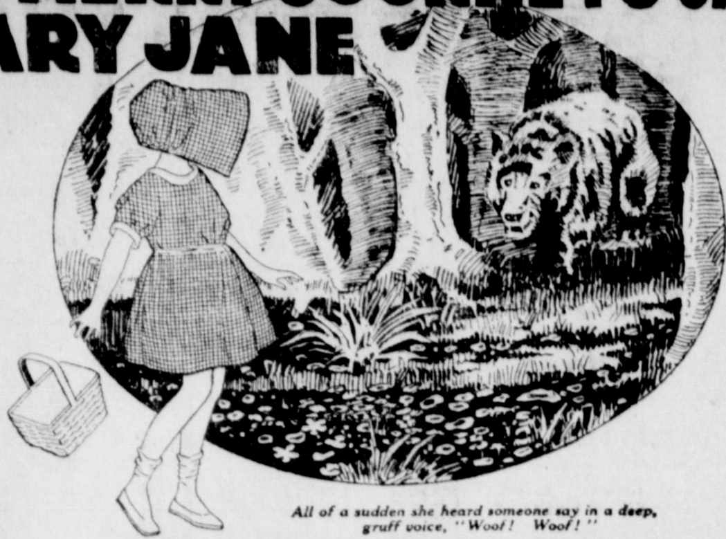
All of a sudden she heard someone say in a deep, gruff voice, "Woof! Woof!"