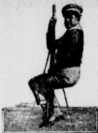
BERT LYTELL The Metro Star, Goes Aloft on His Good Ship, the Nancy.