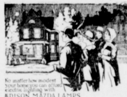
No matter how modest your home you can afford electric lighting with ADISON MADZA LAMPS