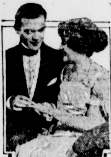
"FANTOMAS" William Fox Production

Herbine corrects biliousness, indigestion and constipation. It is a fine herbal medicine that drives out impurities and restores healthy conditions in the system. Price, 60c. Sold by all druggists.