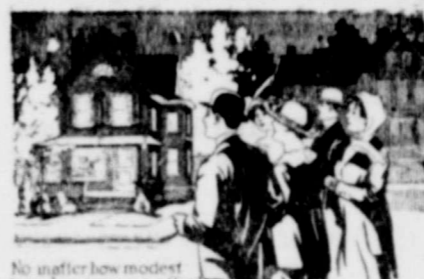
No matter how modest your home you can afford exclusive lighting with EDISON MAZDA LAMPS

Make your Home Attractive by its Lights It Won't Cost much and helps the looks of any home.