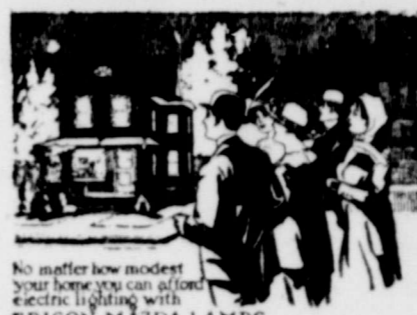
No matter how modest your home you can afford electric lighting with ADISON MAZDA LAMPS

Make your Home Attractive by its Lights It Won't Cost much and helps the looks of any home.