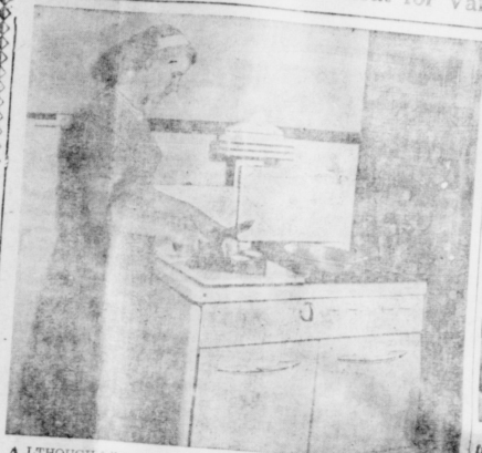
Bernice Knutes, left, slices a round of partially thawed sausage for dinner. All seasonings except the salt were added before the meat was frozen. Bernice is a 4-H girl in Platte county, Neb.