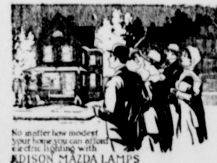
No matter how modest your home you can afford electric lighting with ADISON MADZA LAMPS

Make your Home Attractive by its Lights It Won't Cost much and helps the looks of any home.