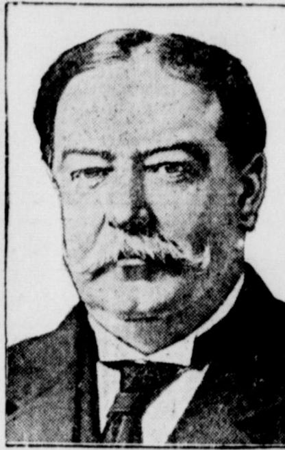
William H. Taft.