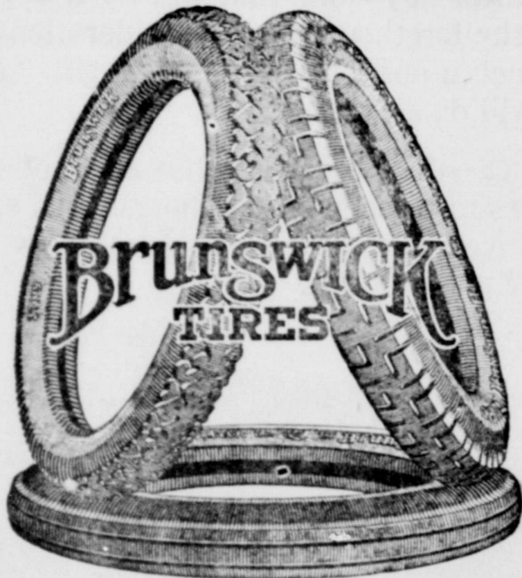
Cord Tires with "Driving" and "Swastika" Skid-Not Treads Fabric Tires in "Plain," "Ribbed" and "BBC" Skid-Not Treads Solid Truck Tires in all sizes authorized by the Society of Automotive Engineers

There's a Brunswick Tire for Every Car Cord—Fabric—Solid Truck