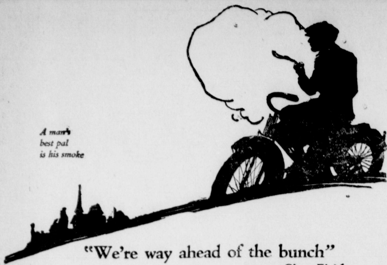
A man's best pal is his smoke