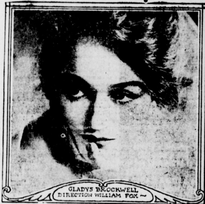
GLADYS BROCKWELL DIRECTION WILLIAM FOX