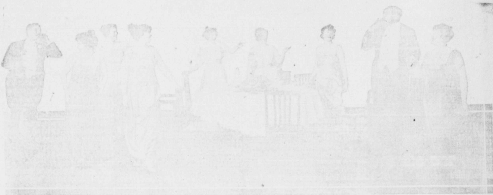
Scene from "THE ONLY GIRL."

The Thirteenth Chair, Nov. 13. Cheating Cheaters, Jan. 12. The Gypsy Trail, Feb. 16