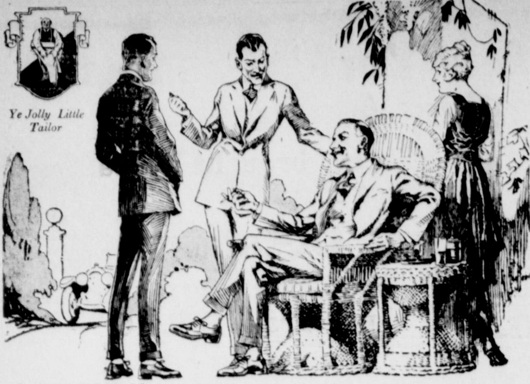
Ye Jolly Little Tailor