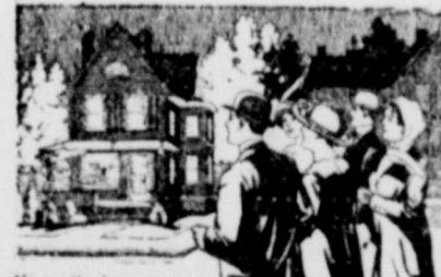
No matter how modest your home you can afford electric lighting with EDISON MADZA LAMPS

Make your Home Attractive by its Lights It Won't Cost much and helps the looks of any home.