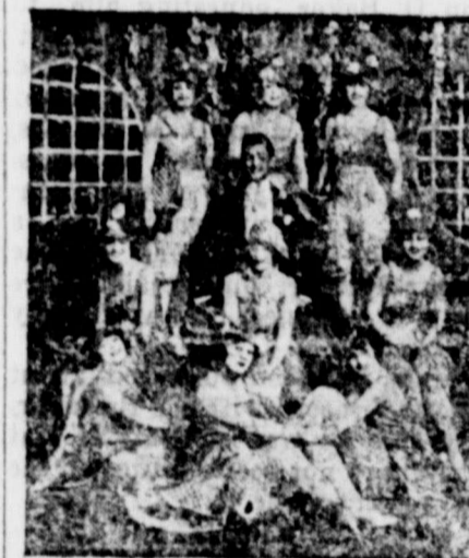
"The Garden of Follies," New York's last word in scintillating, spectacular, Musical Extravaganza, will be a headliner amusement attraction in the coliseum at the Victory Fair at Dallas in October.

VICK'S VAPORUB "YOUR BODYGUARD"—30¢, 60¢, 75¢, 20