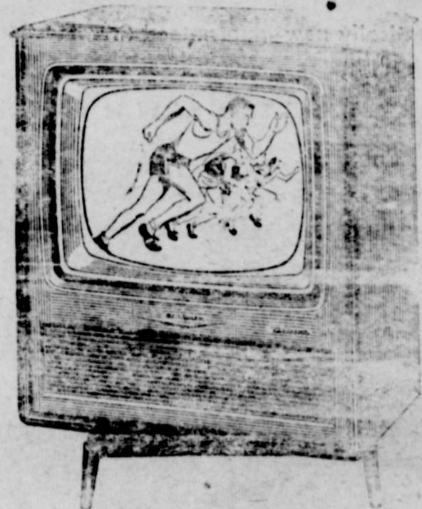
RCA Victor Pantheon Deluxe. Luxury swivel TV! 26 1/2 sq. in. of viewable "Living Image" picture. 3-speaker Panatomic Sound. 3 superb finishes: mahogany, blond tropical hardwood with natural walnut blich. Model 21574B.

The First National Bank Member F. D. I. C. Gorman, Texas