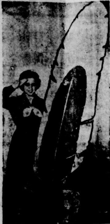
Girl Scouts all across the country salute the biggest Red Feather—symbol of the large scope of Community Chest activities made larger by the cooperation of all good citizens.