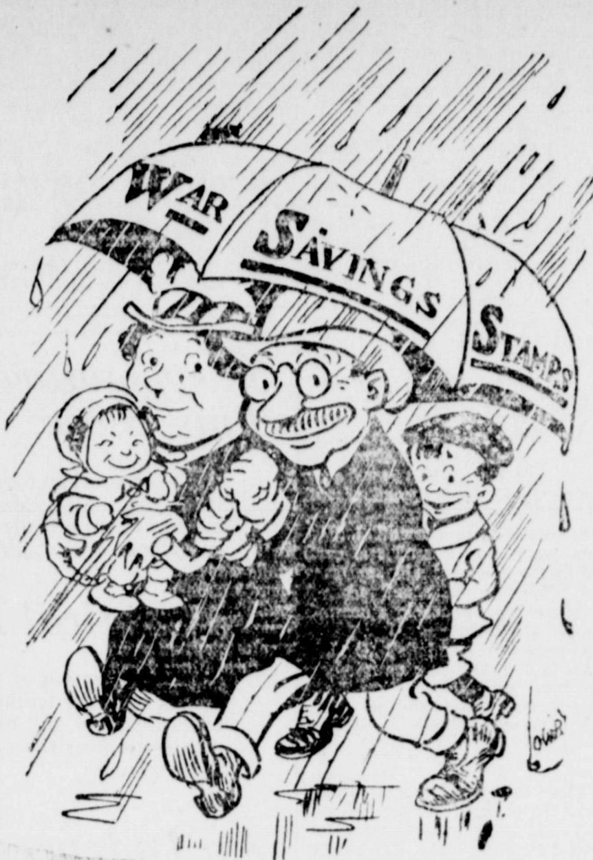
War Savings Stamps are the umbrellas which protect against the driving rain of adversity. Save and buy them regularly and you will have no cause for financial worries.

Have you bought your Thrift Stamp today?