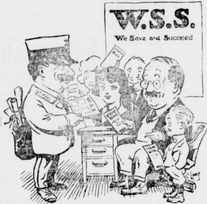
Does your family know the happiness of the Thrift habit? If not, order your Thrift and War Savings Stamps through your mail carrier. He will be glad to deliver them. Or if you are not on a mail route, drop over to the postoffice regularly and buy from your friend, the postmaster.

Have you bought your Thrift Stamp today?