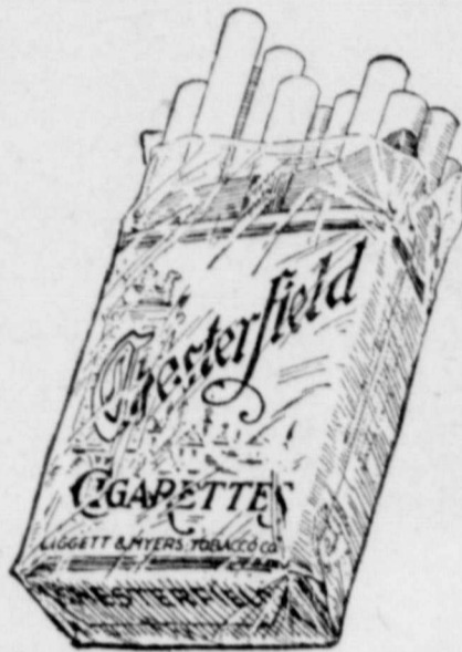
This is the package with the moisture-proof jacket that keeps Chesterfield's original freshness and flavor intact.