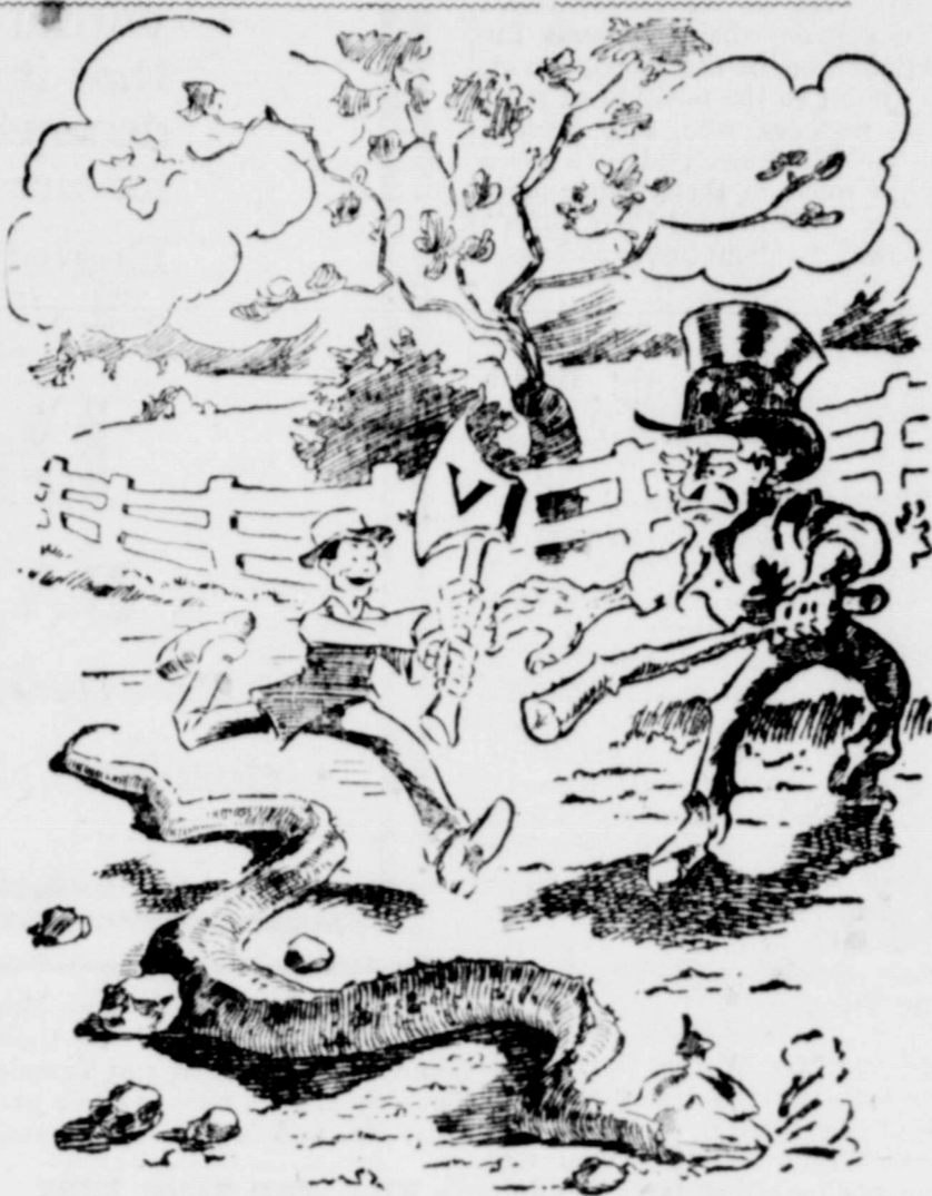
FINISHING THE JOB