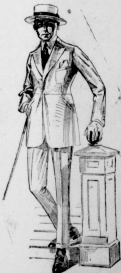
The I. & S. Bing Co. Cincinnati