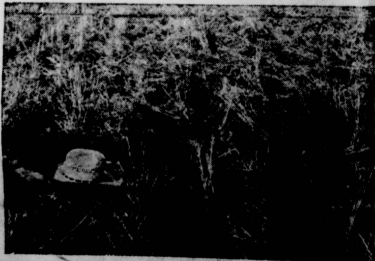
Farming on the contour and stubble mulching helps to hold water where it falls