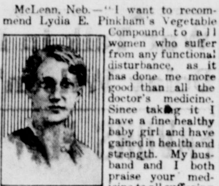
McLean, Neb.—"I want to recommend Lydia E. Pinkham's Vegetable Compound to all women who suffer from any functional disturbance, as it has done me more good than all the doctor's medicine. Since taking it I have a fine healthy baby girl and have gained in health and strength. My husband and I both praise your medicine to all suffering women."

This Woman Recommends Lydia E. Pinkham's Vegetable Compound—Her Personal Experience.