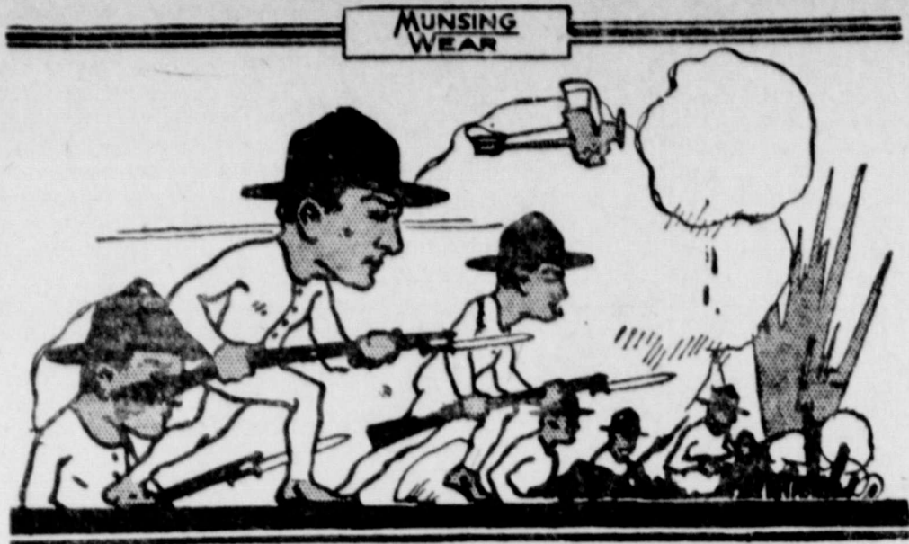
The Battle Cry of Free 'Em