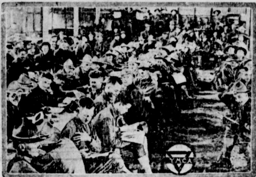
When the soldier is off duty he may employ and amuse himself in many ways, but one of the first things he is sure to do is to write to home folks. Writing paper, envelopes, ink and pens are furnished free to the men by the Army Y. M. C. A.

This is a picture of a "rush hour" of letter writing and magazine reading in a "Y" building in a large camp of the Southern Department.