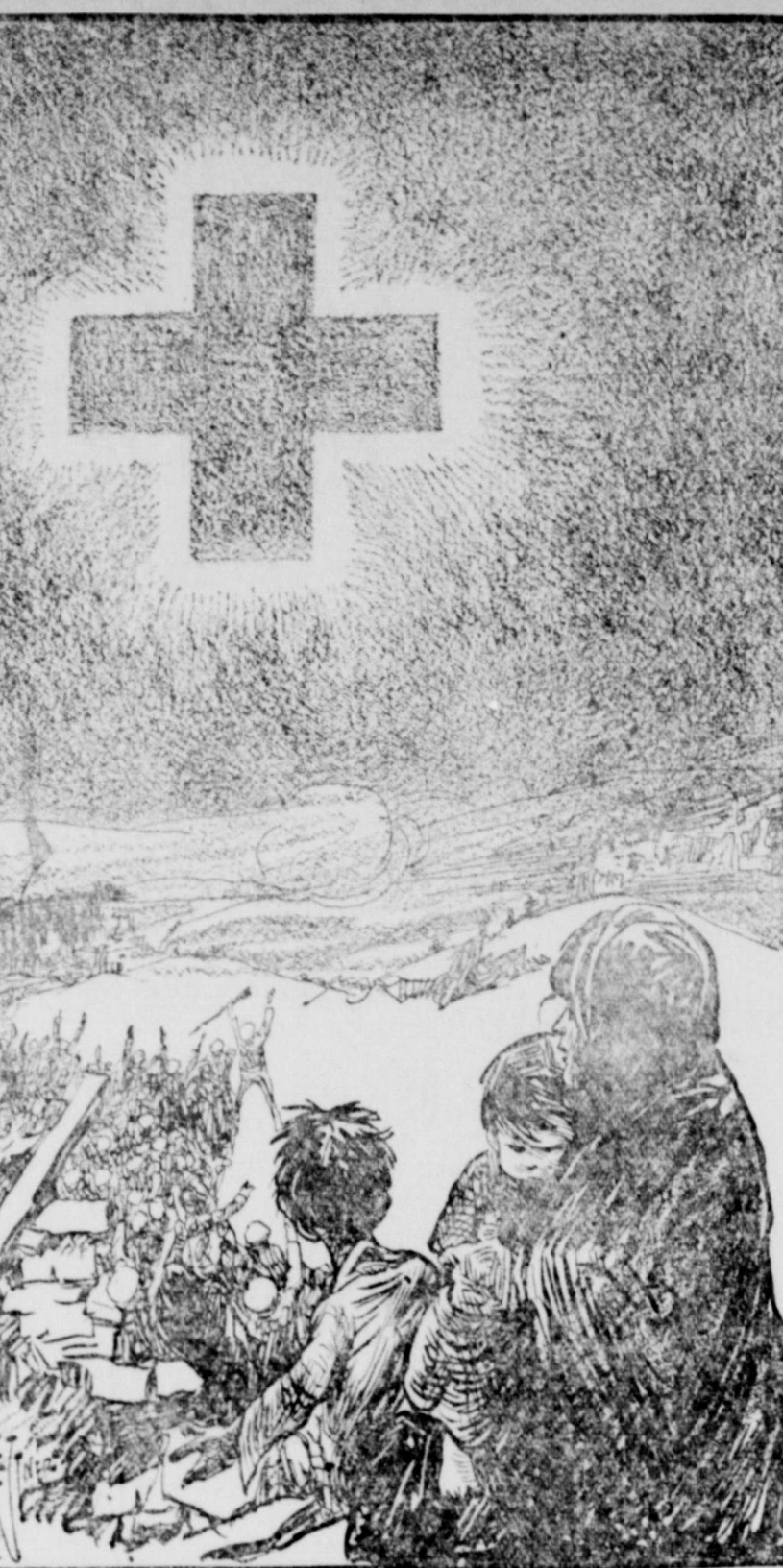
Millions and millions of stricken people in devastated Europe must depend on the activity of the Red Cross alone for the most meager necessities of life—just enough to keep body and soul together. The Red Cross organization is the universal helping hand. But in order to extend this hand to the sorrowing and afflicted, it must have your support. In fact, if you would do your part to relieve the suffering in the world, you can do it most directly and efficiently through the Red Cross. Become a member today.