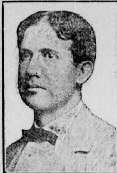
Hon. Wm. P. Hobby.

The following telegram was received Saturday afternoon by County Judge O. L. Parish from Governor Hobby, coming immediately after the announcement that Runnels County had been freed of ticks, and that the quarantine line had been moved over from Runnels County: