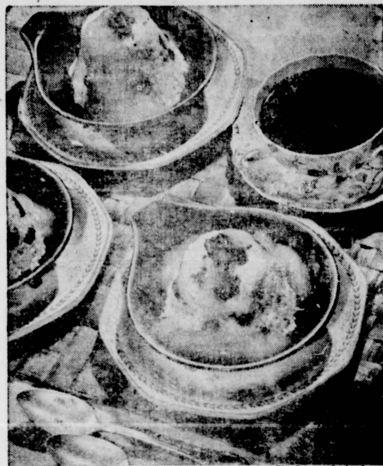
Rice Consumer Service, Inc.

Jin. Horton Tire Service East Main Eastland