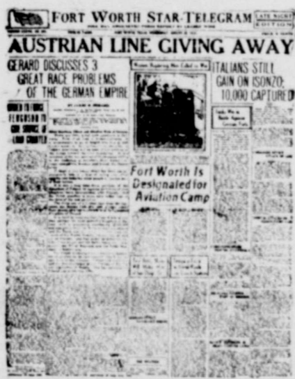
Read The Star-Telegram, the paper with complete war service.