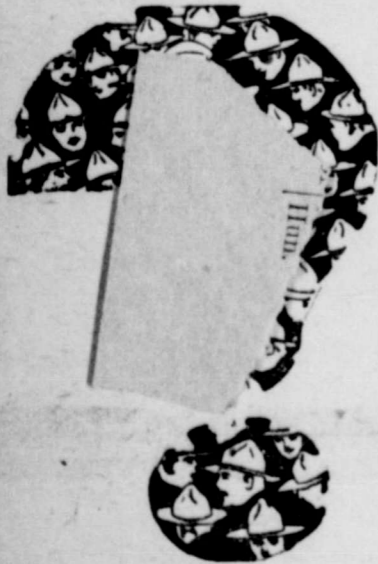
What will happen to our soldier boys in 1918?