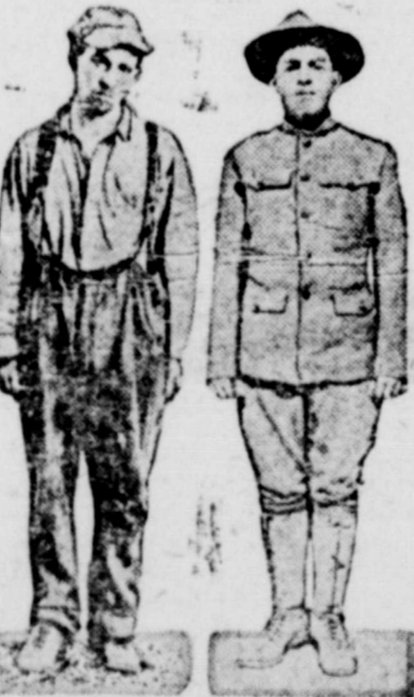
AFTER FIVE MONTHS. The two pictures are of the same young man. The first was taken the day he enlisted and the second after he had had five months' military training. His home is in North Carolina.

The art and loan exhibit, which will contain, in addition to the treasures loaned by amateur and local professional artists and sculptors, interest is centered on a famous collection in the way of an "art loan," which includes the work of world famous artists.