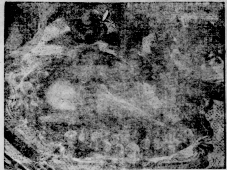
Elmer Consumer Service, Inc.

7 room house, 2 acres of land and well, and small 2 room house and well on Okra road in Carbon all for sale.—see W. T. Gibbons,