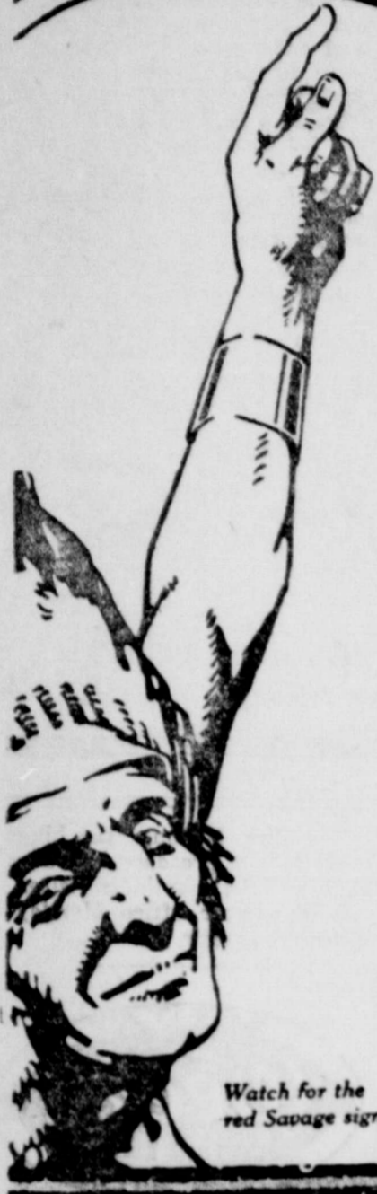
Watch for the red Savage sign

SAVAGE GRAPHITE TUBES The only tubes that have graphite vulcanized into the surface. Prevents deterioration, sticking, friction and heating. Makes scapstone unnecessary. Lengthens the life of the tubes.