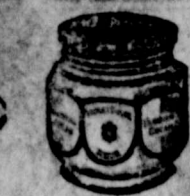
Violet Dulce Vanishing Cream

Is quickly absorbed. An excellent cream for use under powder.