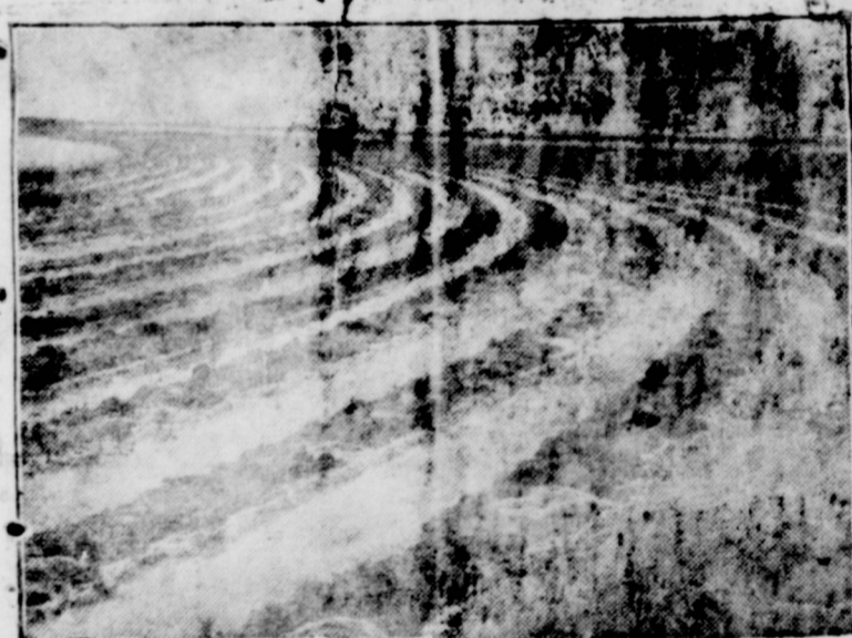
Farming on the contour and stable mulching helps to hold water where it falls