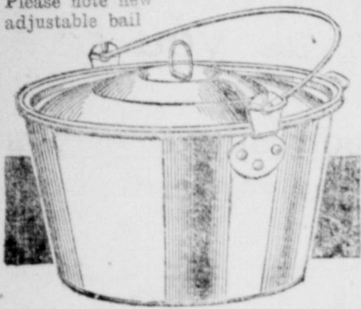
Replace utensil that wear out with utensils that "Wear-Ever"

Useful Every Day Please note new adjustable bail