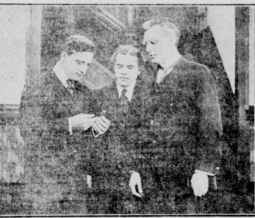
"GET THAT MAN'S FINGER PRINTS!"