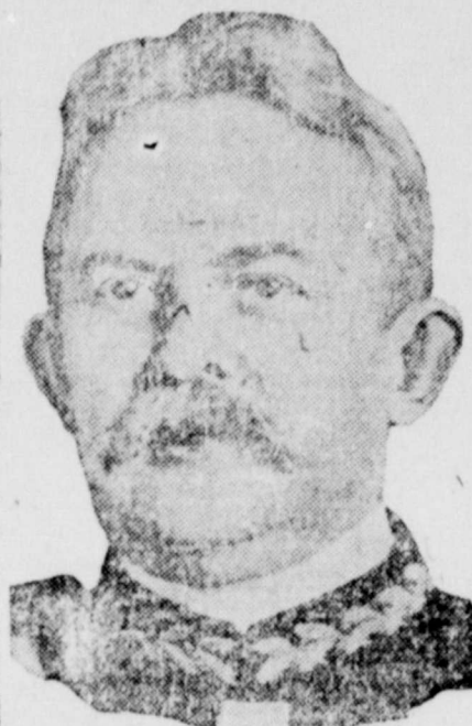
Major General J. Franklin Bell