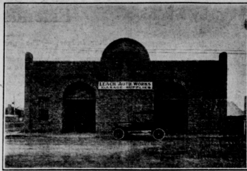
City Auto Works Destroyed by Fire Friday Night.

The chautauqua brings their own tent and stage effects and all that is required of the local committee is to secure a place to put up the tent and arrange for seating same. This has already been attended to, and the big tent will be stretched on the lot near the Church of Christ tabernacle on Eighth street. This is centrally located and will be convenient for both the town and country people who will attend the chautauqua.