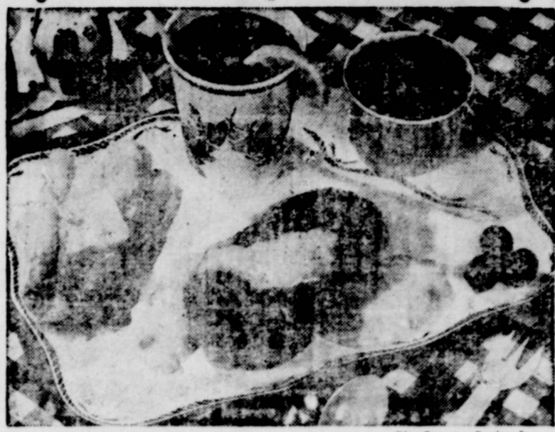
Illustration by Consumer Service, Inc.