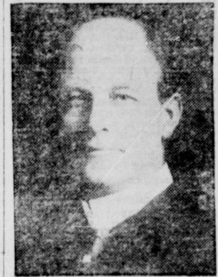
Capt. R. P. Hobson

It is announced in connection with the great campaign that is being conducted by the Anti-Saloon League of Texas, going to the four corners of the State, carrying the story of prohibition to approximately 400 towns and cities, that we will have as one of the speakers, Capt. R. P. Hobson, known as "the hero of the Merrimac," and a man who has sacrificed his life in the interest of prohibition, who presented a resolution in Congress asking for National prohibition. Capt. Hobson will address the citizens of Ballinger, April 10, 8:00 p. m., at the Methodist church.