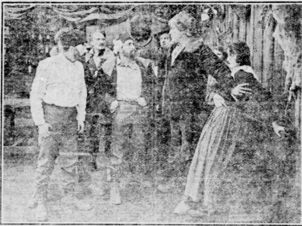
THE GREAT MASTER SHIELDS THE DANCE HALL DOVE.

A reptile in the throes of a struggle to the death with a formidable foe sometimes will attack itself and believe it is maiming the enemy. This is what that reptilian band, The Secret Seven, was doing. Dr. Zulph, suspecting that there was a traitor in camp, was determined first to put Strong out of the way and then to lay hands on the one who was false. The Great Master, brains of the band, was balking Zulph. He knew that the murder of William Montgomery Strong, man of wealth and prominence, would shock the entire community and sound the death knell of The Secret Seven. Twice The Great Master had saved Strong's life—first when he ordered his East Indian servant to release him when he was kidnapped after the case of tainted treasure had been found in his home, and again when the sable hood went to his sick bed. What was back of this working at cross purposes in the ranks of the hitherto invincible Secret Seven? Therein lay part of the skein of mystery that surrounded the great secret of the all powerful organization. And so The Secret Seven was battling with itself like a frantic reptile. The Great Master represented the brains of this reptile and Zulph the teeth and claws. Perhaps one faint clue to this